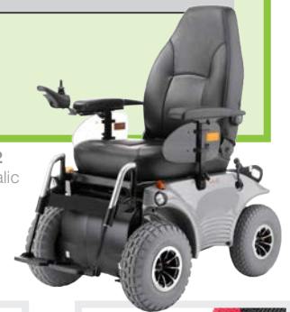
Optimus 2 Silvermetallic

RS Edition: Includes Black Chassis & Rims, Black/Red ErgoSeat, Upholstery & Calf Strap, Red Calf Strap attachment, Motor Release Level, Drum Brake & safety reflector signal.