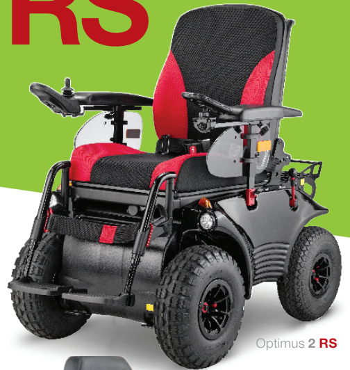
Optimus 2 RS