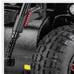
Excellent traction and off-road handling