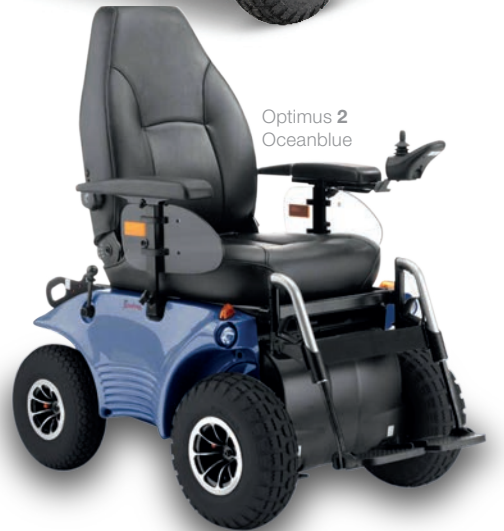
Optimus 2 Oceanblue