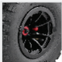
Black aluminium rims