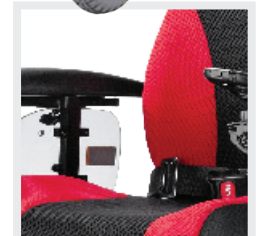
Comfortable and adjustable seating